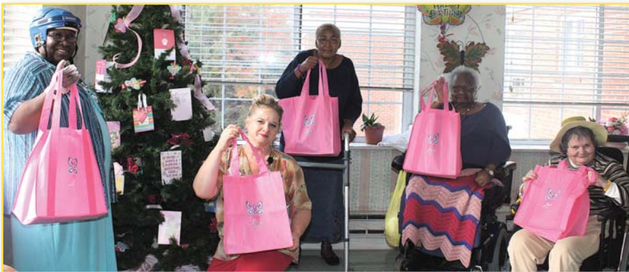
The Village Green of Waterbury by Revera, who donated 15 bags and cards of hope from their own Red Hat Mamas and Veterans Silver Knights.

Chemtura's Fun Team Committee , who generously donated proceeds from their annual Holiday Poinsettia Plant Sale to HLRCC